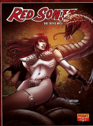
Cover A (10/11) Fabiano Neves