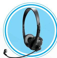
COBY CD-128 Headset