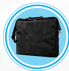
Laptop Sling Bag