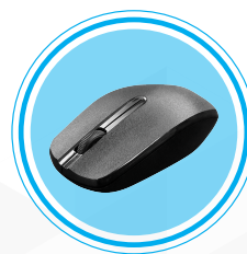
PIXPRO WM300 Wireless Optical Mouse